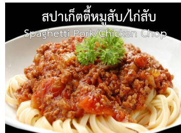
สปาเก็ตตี้หมูสับ/ไก่สับ Spaghetti Pork/Chicken Chop