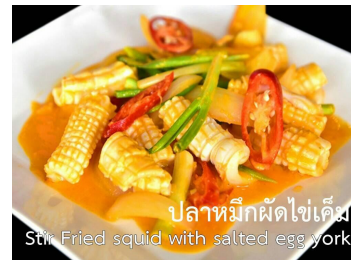
ปลาหมึกผัดไข่เค็ม Stir Fried squid with salted egg yolk