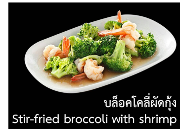
บรอกโคลีผัดกุ้ง Stir-fried broccoli with shrimp