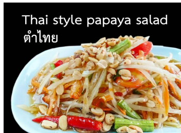
Thai style papaya salad ตำไทย

TWP Korat has a restaurant and bars that offer a wide range of dishes and beverages to suite different tastes. They normally opens from 9:00 to 19:00, but during the competition days, they'll open till late.