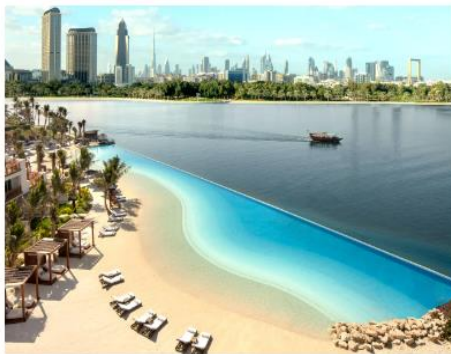
PARK HYATT DUBAI

To book your stay at one of these hotels, you can visit their websites or call them directly. You can also find more information about the event and the host hotels on the World Wake Association website. Don't miss this opportunity to experience the thrill of wakesurfing in Dubai Creek Marina!