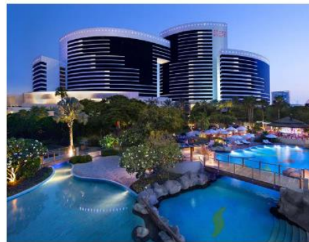
GRAND HYATT DUBAI

Park Hyatt Dubai is a 5-star luxury resort hotel located on the banks of the Dubai Creek.