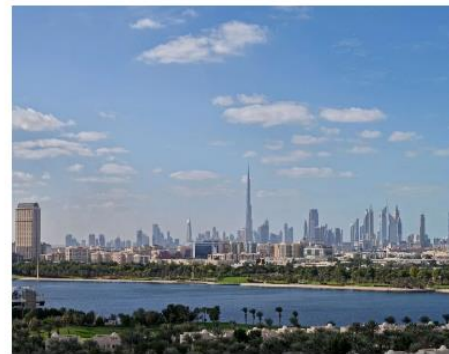
HYATT REGENCY DUBAI CREEK HEIGHTS

Grand Hyatt Dubai is a luxurious hotel located near Sheikh Zayed Road, one of the busiest roads in Dubai.